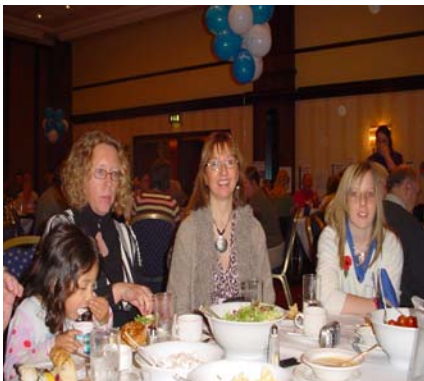
Enjoying the conference food!

In 2007 we will look at ensuring that all the network are working towards these standards.